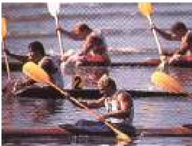
Teams battle for medals in the finals of the men's Kayak-2 1000 m. Unless otherwise noted, all photographs have been shot with Fuji film.