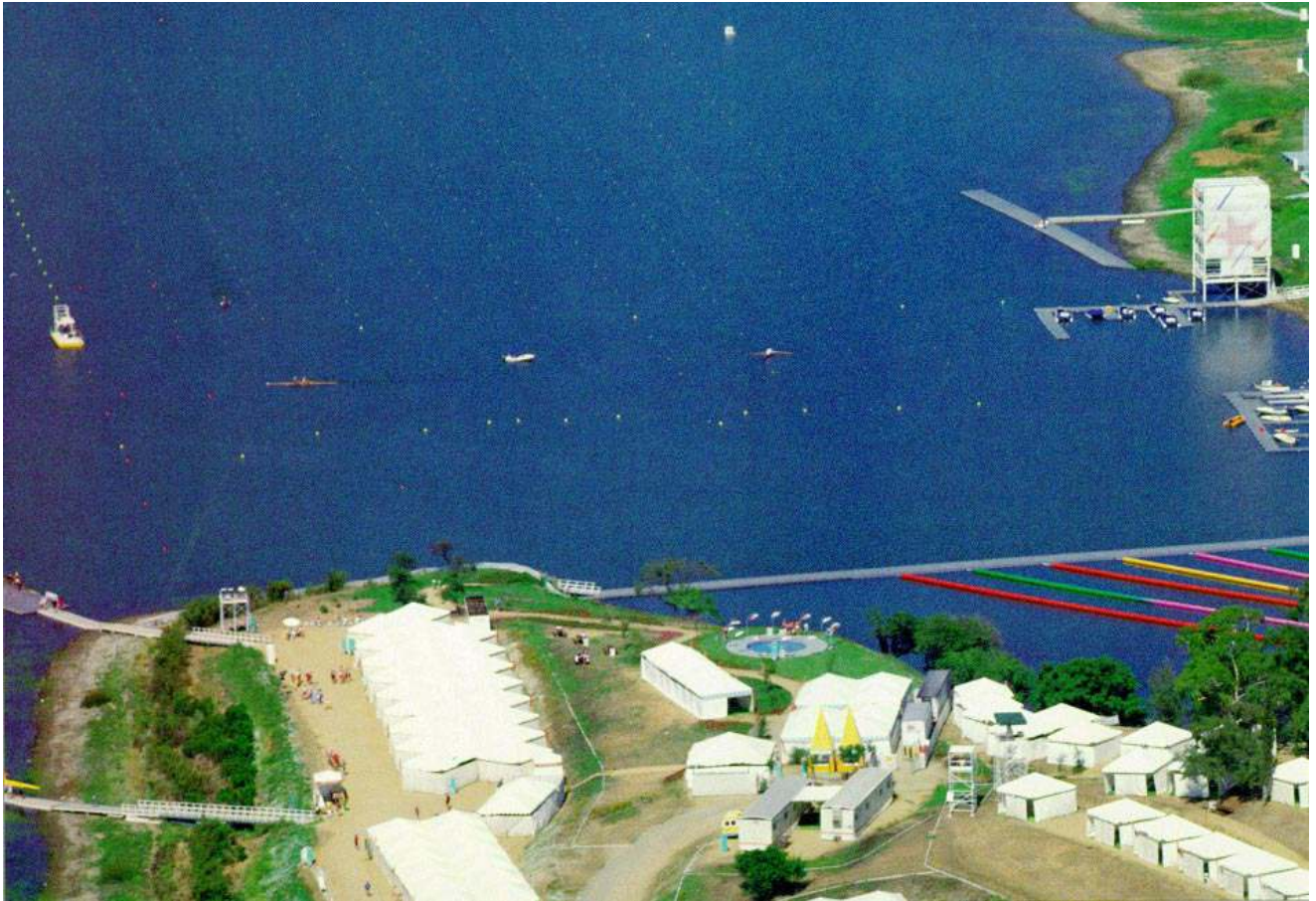
Lake Casitas, Ventura county (10,000)