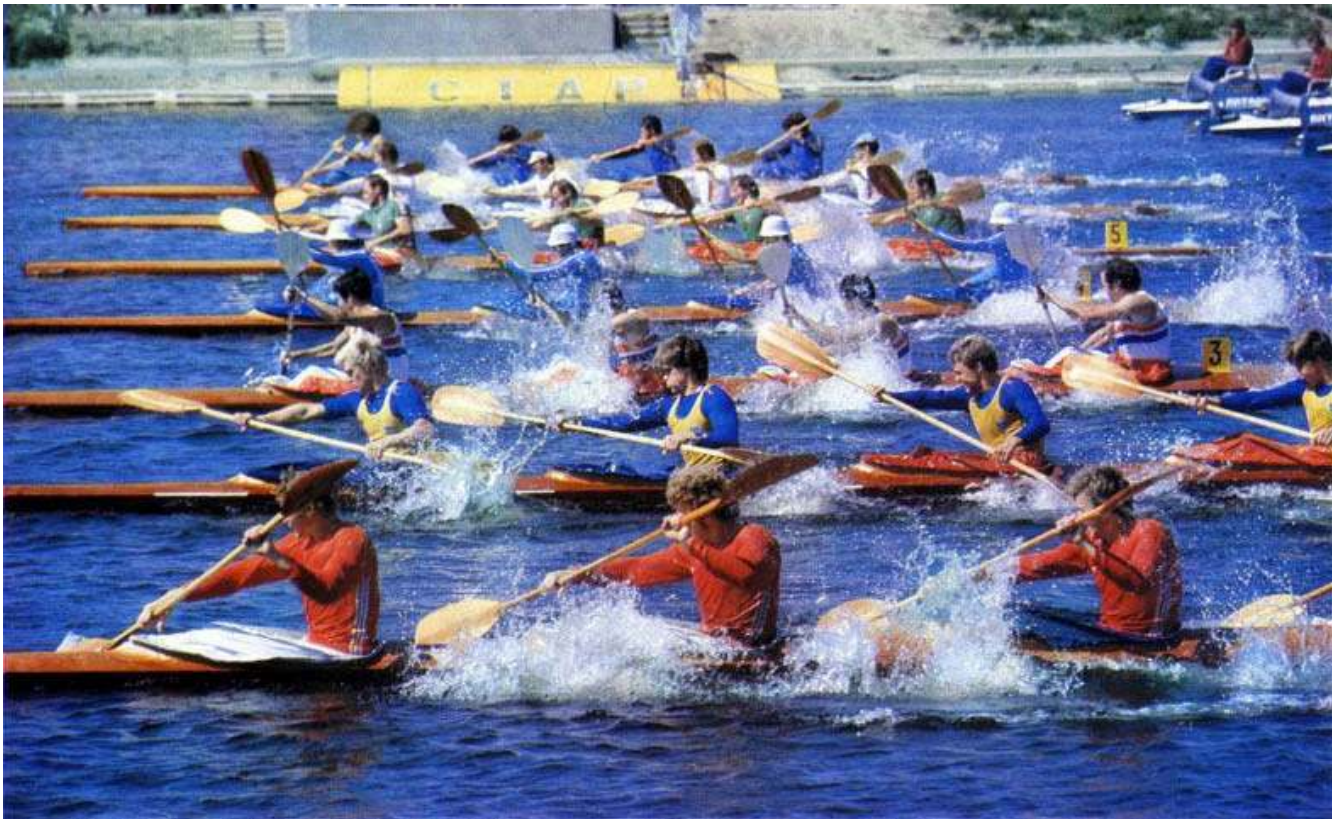
Kayak fours starting.