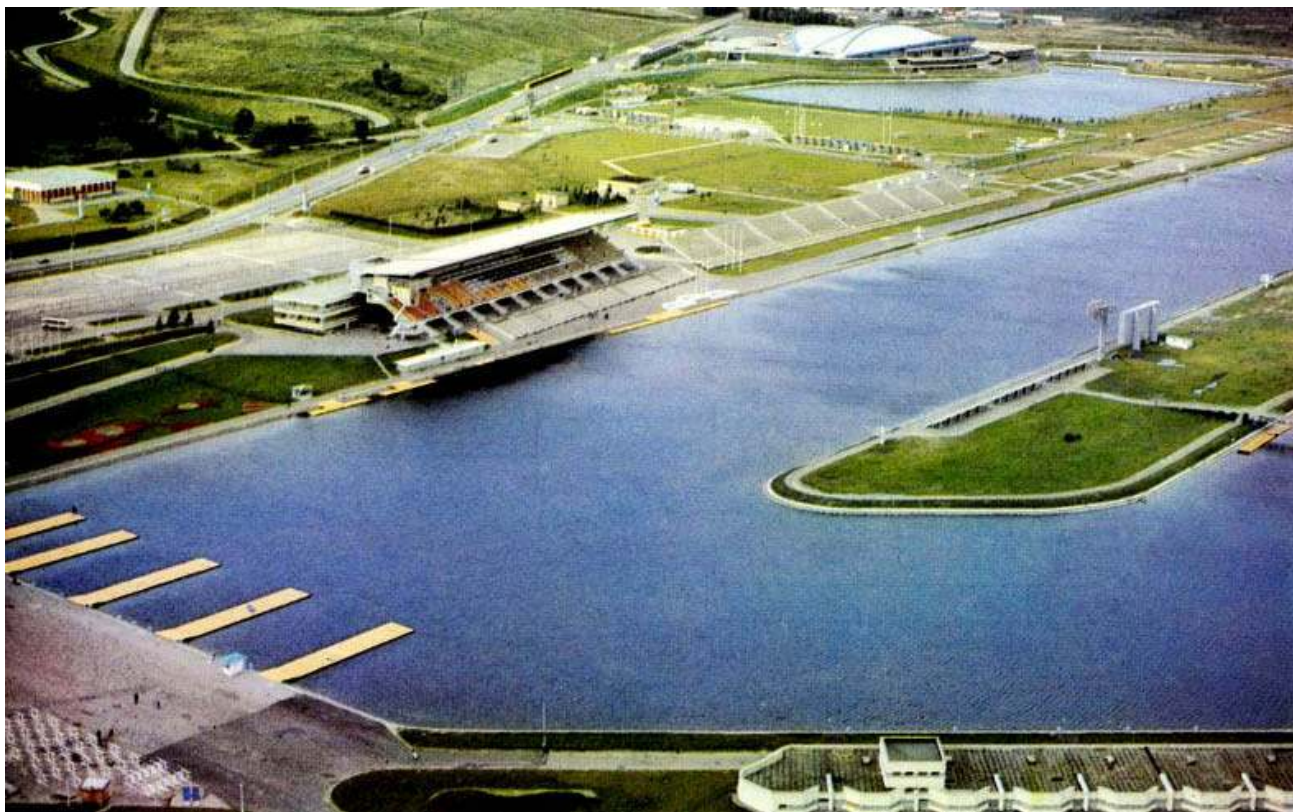
The Moscow Canoeing and Rowing Basin.

Canoeing at the 1980 Summer Olympics was held in the Man-made Basin, located at the Trade Unions Olympic Sports Centre (Krylatskoye district, Moscow). The canoeing schedule began on 30 July and ended on 2 August. 11 canoeing events were contested.