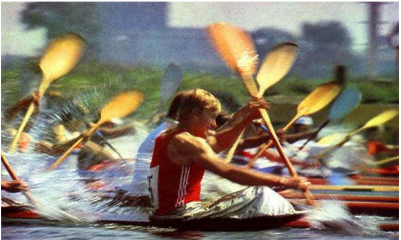
Start of Kayak pairs, 1,000 m.