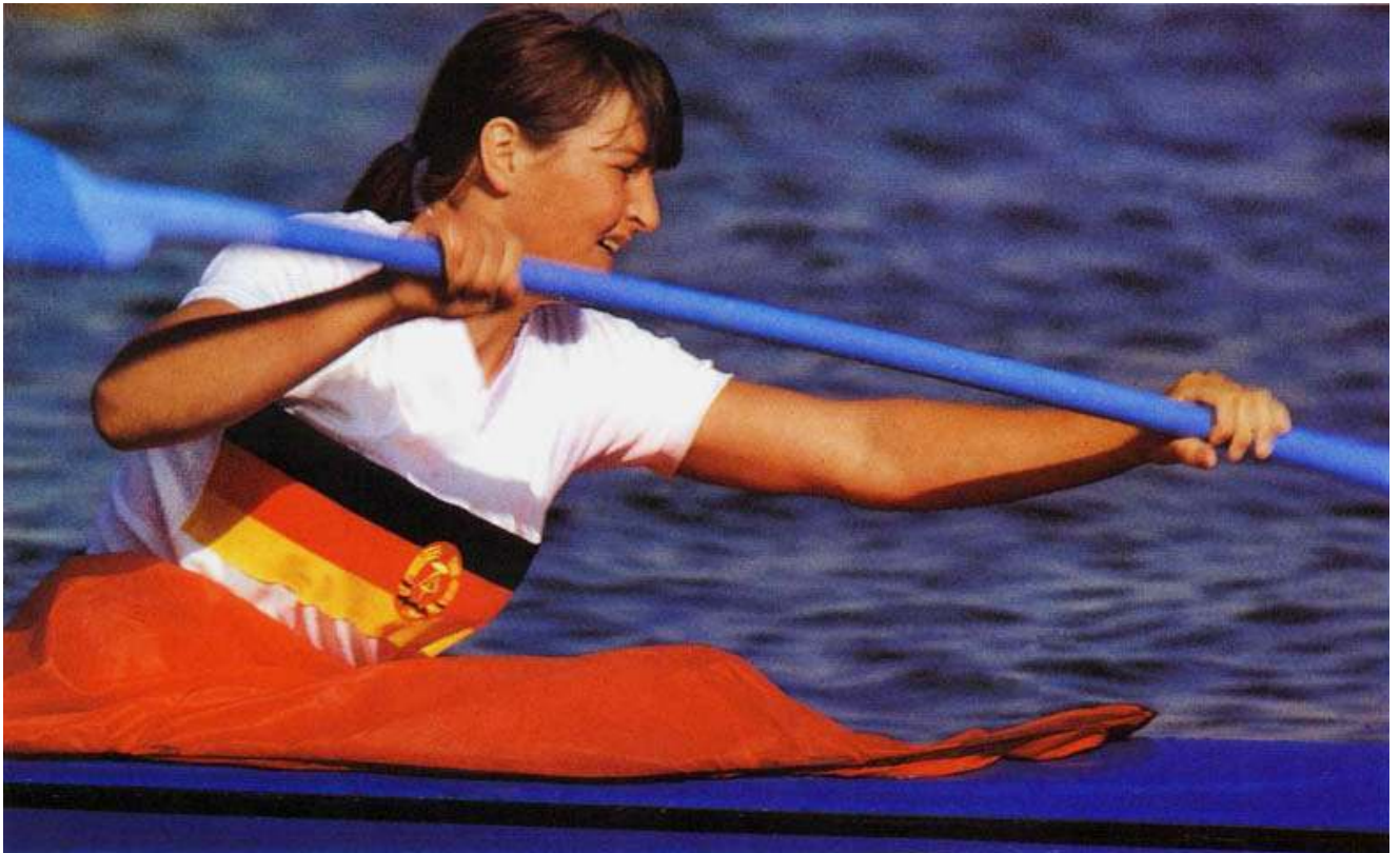
Birgit FISCHER (GDR), winner in K-1.