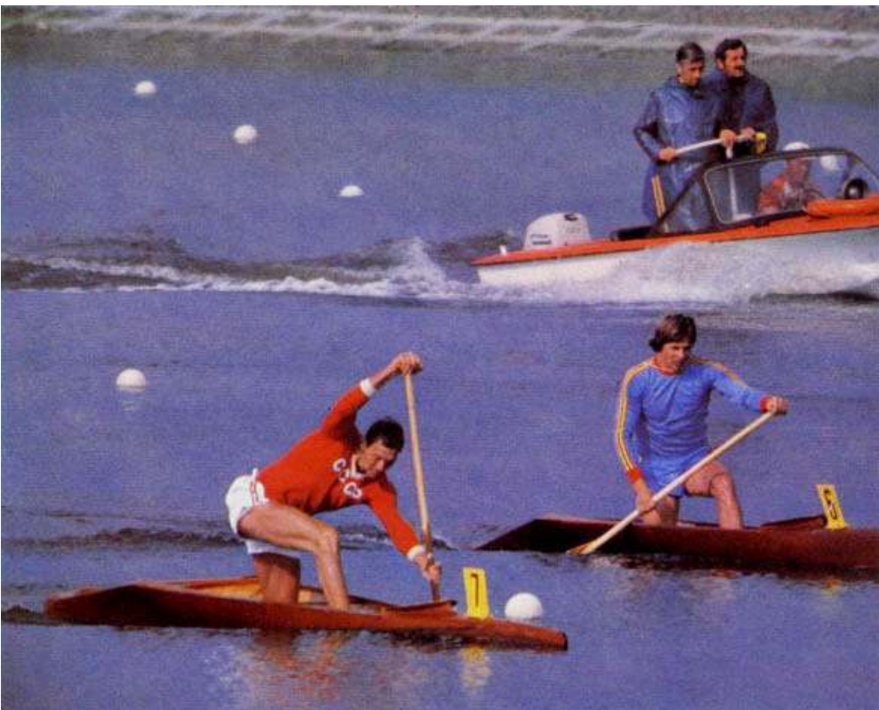
Sergei POSTREKHIN (USSR) and Liubomir LIUBENOV (BUL), shared the top award in C-1 500 m and 1,000 m.