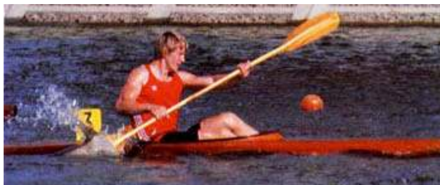
Vladimir PARFENOVICH (USSR)