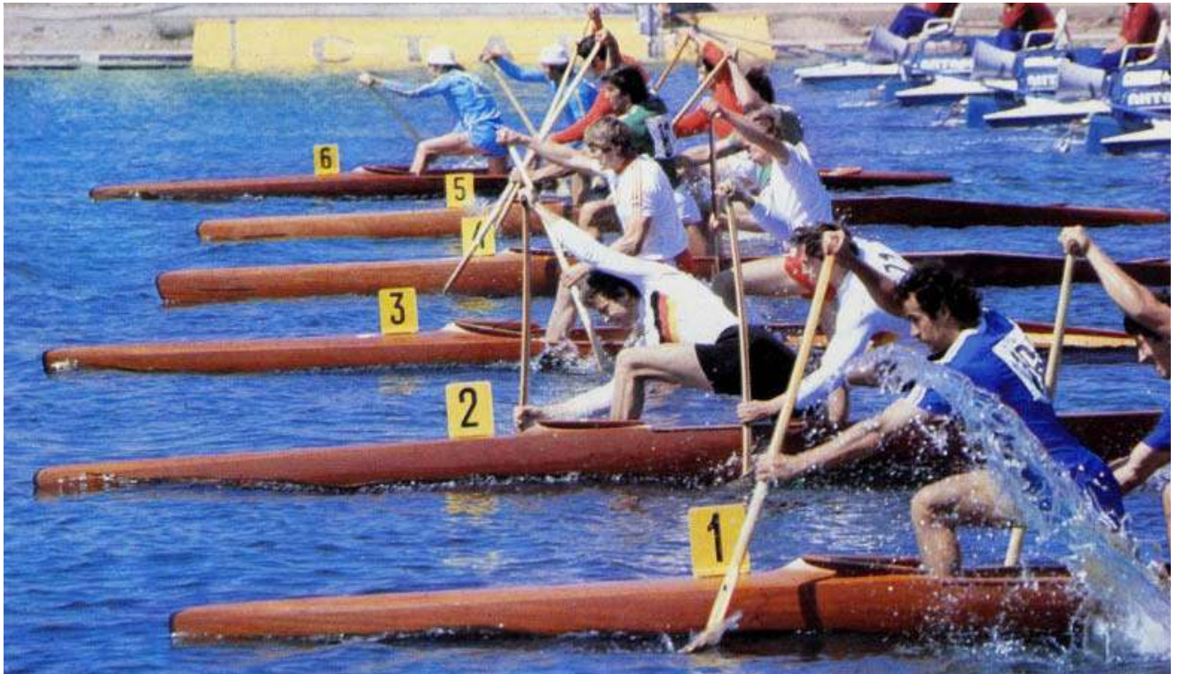
Start of Canadian pairs, 1,000 m.