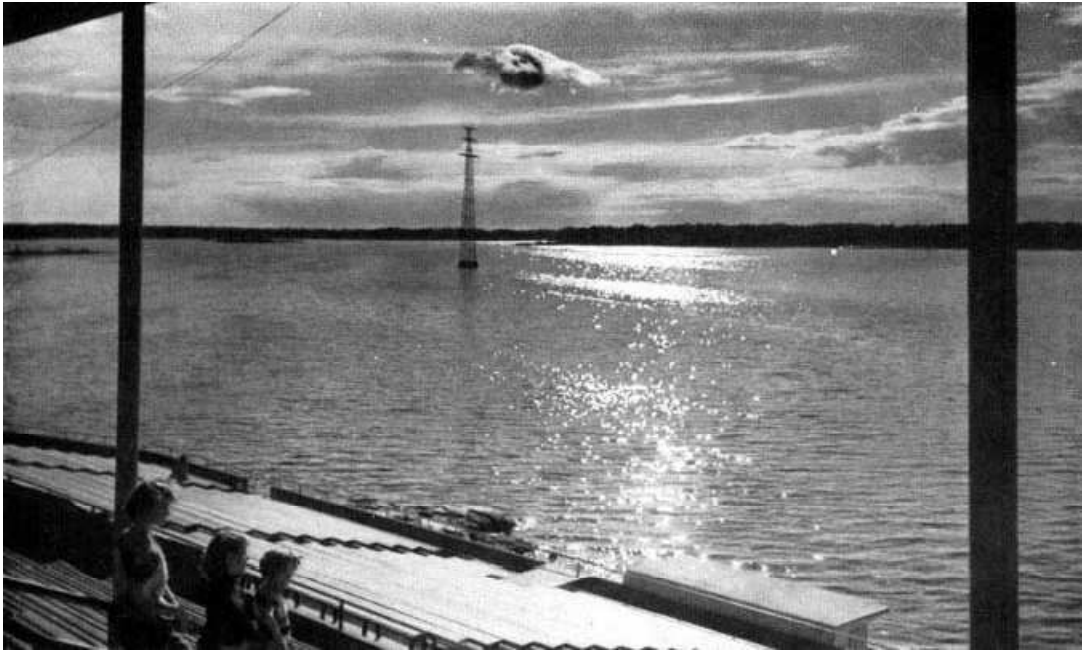
The view from the stand at Taivallahti.

The roofed Grand Stand at Taivallahti was enlarged by building an open concrete stand in front of it. Dressing rooms were located in the Grand Stand basement. In the near vicinity were an office building and canoe sheds.