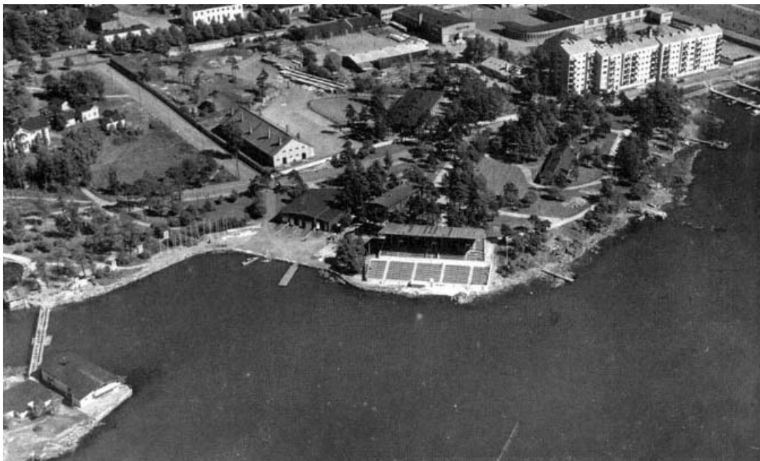
Air photo of the Taivallahti Canoeing Stadium.