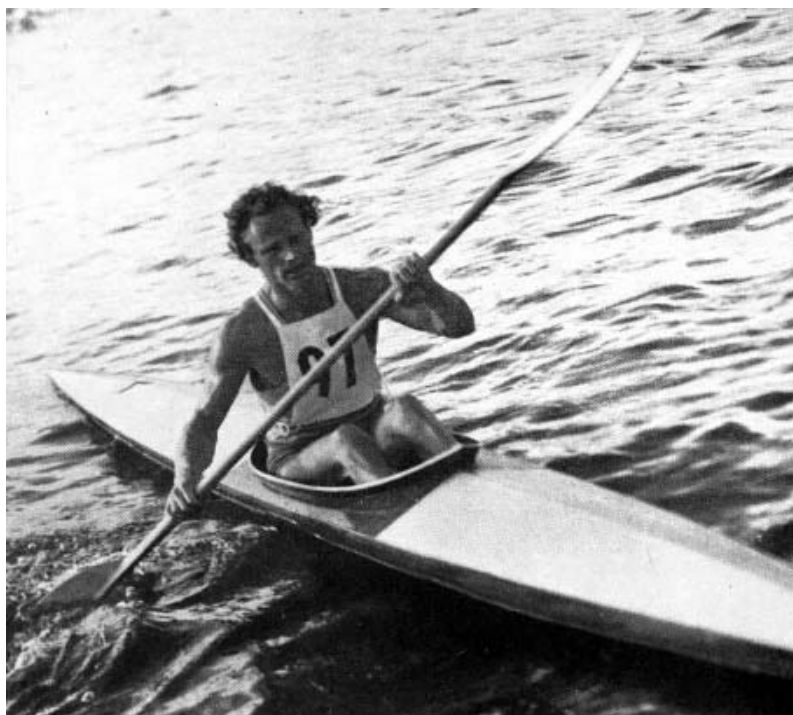
Gert FREDRIKSSON (Sweden), champion for the second time in the 1,000 m Kayak Single event.