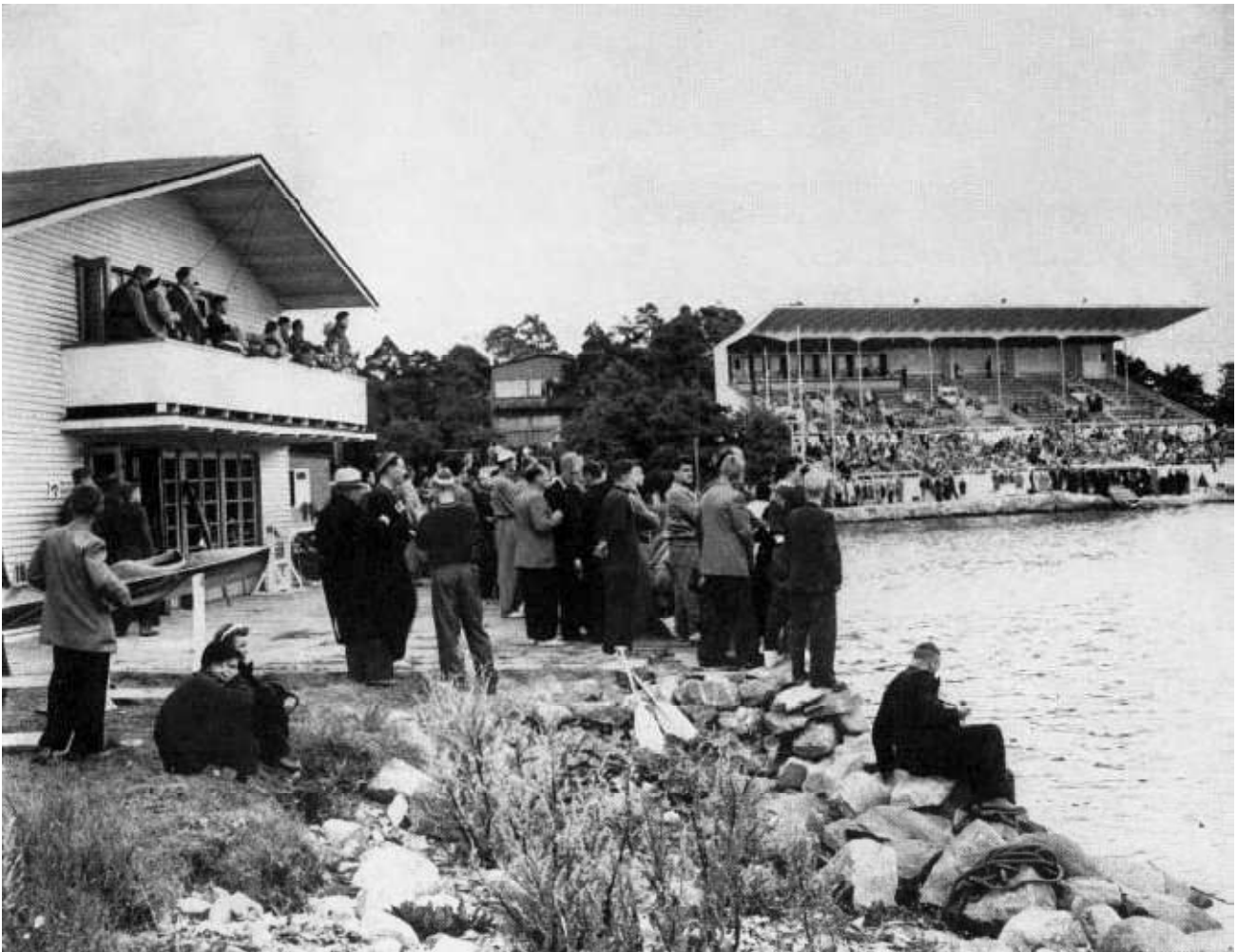
The Grand Stand of the Taivallahti Canoeing Stadium.

Gert Fredriksson of Sweden, Gold Medal defender and several times world title-holder, hung on to Strömberg right to the last kilometer. As the Swede is famous for his powerful spurt, it began to look as though he had the race well in hand. But the pace set by the Finn had told. When Strömberg broke into a vigorous spurt Fredriksson was in no condition to challenge him. The German Scheuer surprisingly drove a wedge into the Northern Countries' front by taking third place.