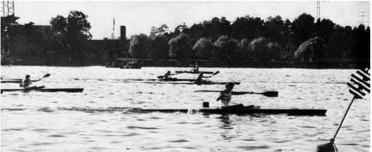
The leading paddlers in the women's 500 m cross the line. Nearest the camera G.Liebhart (Austria), in the middle the champion S.SAIMO (Finland), behind her N.Savina (USSR).