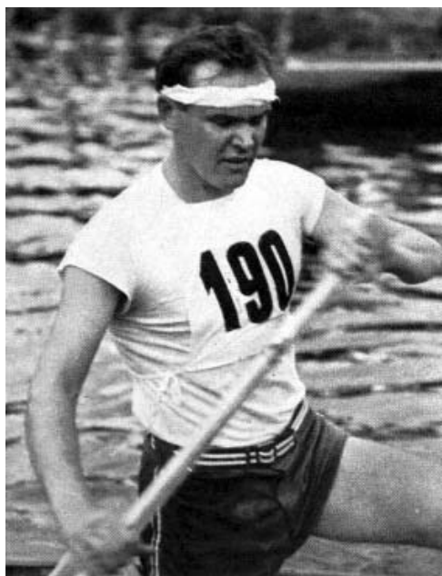
Frank HAVENS (USA), champion in the 10,000 m Canadian Singles event.