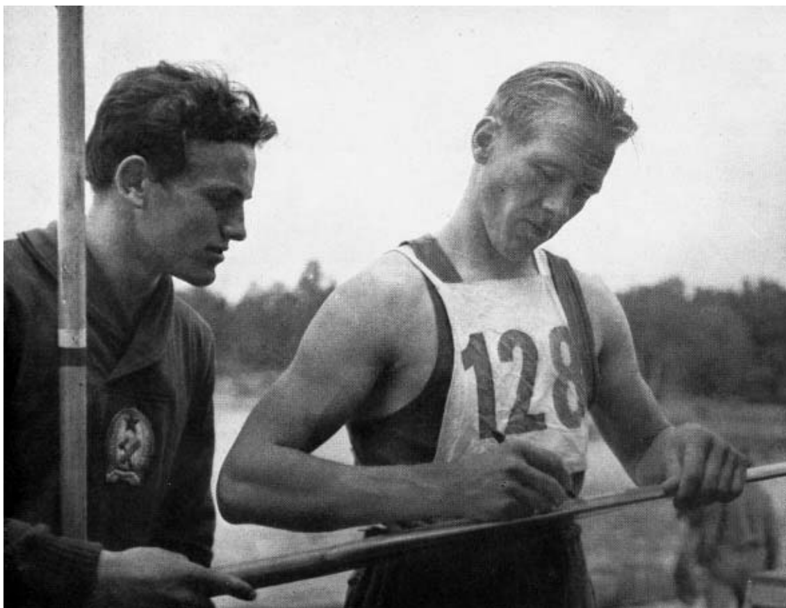
Thorvald STRÖMBERG (Finland), champion in the 10,000 m Kayak Single event.