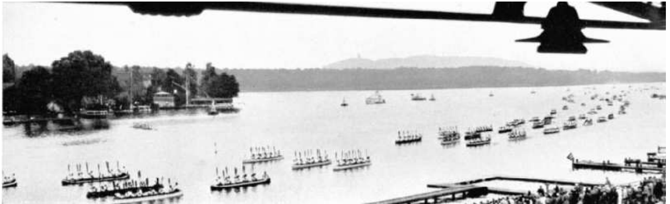
116 ten-seater Canadians with young German sportsmen greet the Olympic guests.

Photographs were taken at the finishing line. One hundred and fifty-eight canoeists from 19 nations took part in the canoe races. Fifty-eight boats participated in the long distance regatta and 39 in the short distance regatta. All nations had sent in their entries before the closing date. The only late entry came from Latvia, and as the official date for entry had passed, it could not be given consideration.