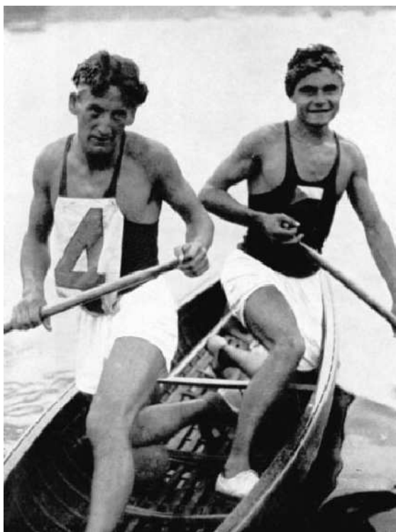
Václav MOTTL and Zdeněk ŠKRDLANT (Czechoslovakia), Olympic champions in the two- seater Canadian event.

WIND: practically no wind and, therefore, smooth water; in so far as wind was at all perceptible, it blew in the racing direction