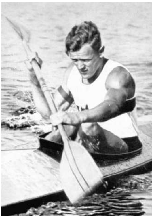
The Olympic champion in the one-seater kayak race: Ernst KREBS (Germany).

WIND: practically no wind and, therefore, smooth water; in so far as wind was at all perceptible, it blew in the racing direction