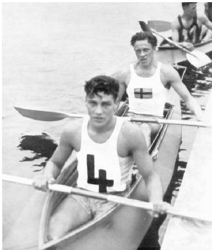
The Olympic champions in the two-seater collapsible canoe event, Sven JOHANSSON and Eric BLADSTRÖM (Sweden), following a hard race with Germany.

WIND: practically no wind and, therefore, smooth water; in so far as wind was at all perceptible, it blew in the racing direction