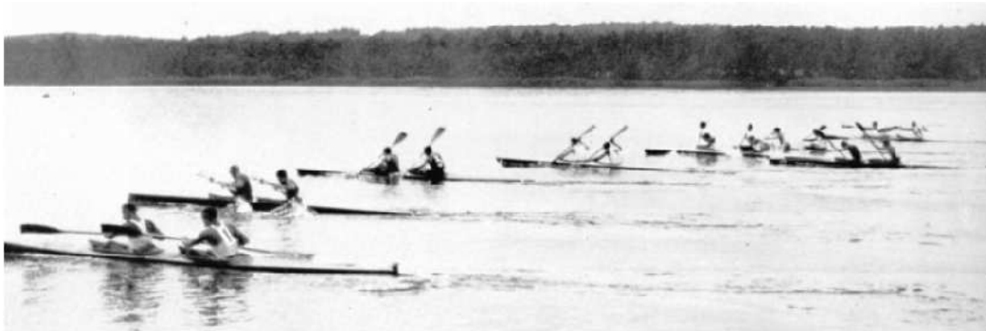
The two-seater kayaks fight for the lead.