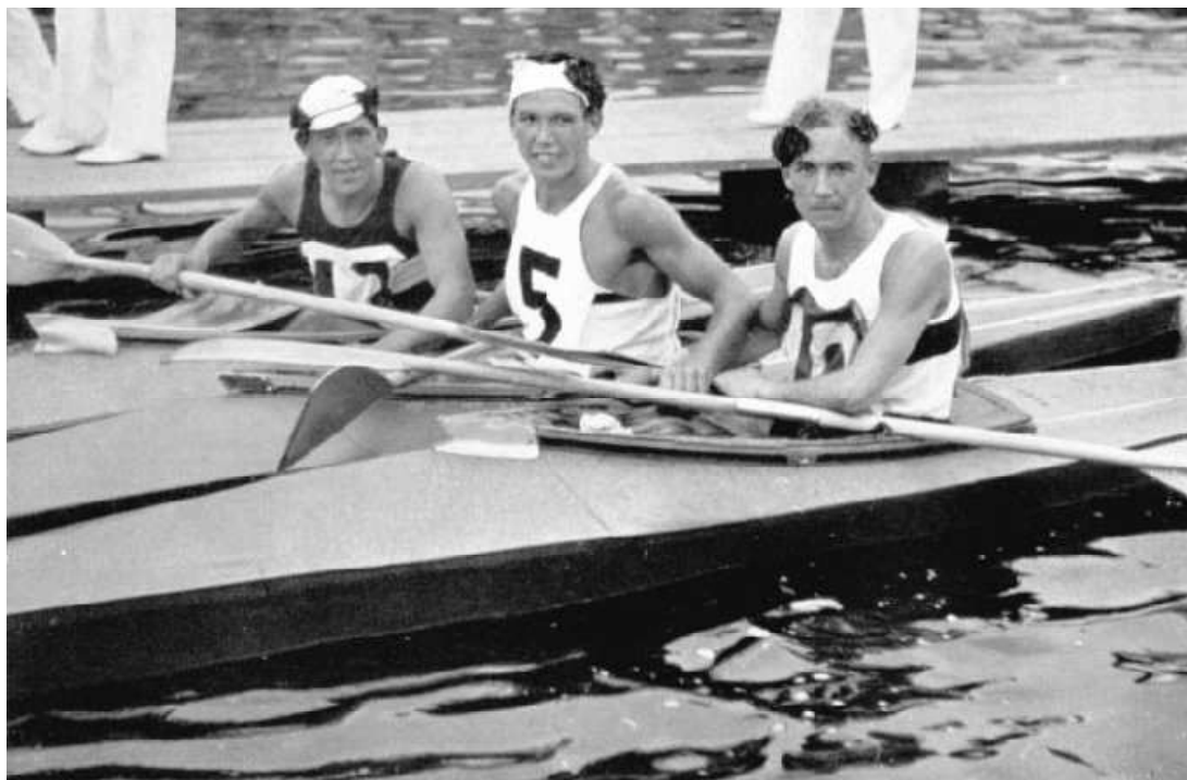
The Olympic medalists in the one-seater collapsible canoe race (left to right): Gregor HRADETZKY (Austria), Henri EBERHARDT (France) and Xaver HÖRMANN (Germany).

WIND: practically no wind and, therefore, smooth water; in so far as wind was at all perceptible, it blew in the racing direction